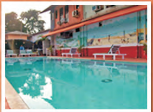
Sunflower Beach Resort