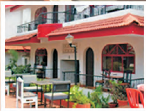
Sunshine Beach Resort